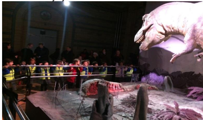
Year 3 had the 'earthquake' experience!

Year's 1,3,4 and 5 have kept the National History Museum busy- yr 1 visited the dinosaurs!