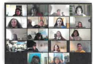
Shabbat Shalom from the Jewish Studies team

Year 5 and 6 have been working really hard, getting ready for the continuing partnership with pupils in Israel. This meeting focused on favourite foods and the pupils were able to learn about the food in different cultures and realise that although far apart they shared similar tastes and cuisines.