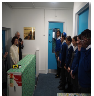
Year 3 sang a song in lvrit. We are really proud of all our children!

Year six performed a poem. They were brilliant.